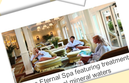
Springs Eternal Spa featuring treatments with local mineral waters