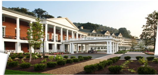
AAA Four Diamond Resort