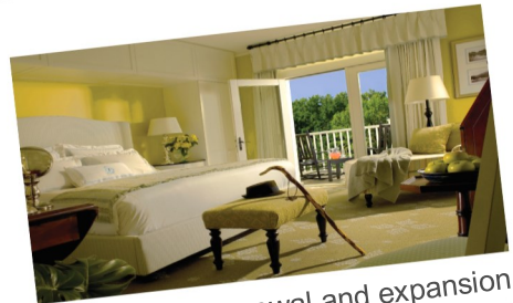
$120 million renewal and expansion